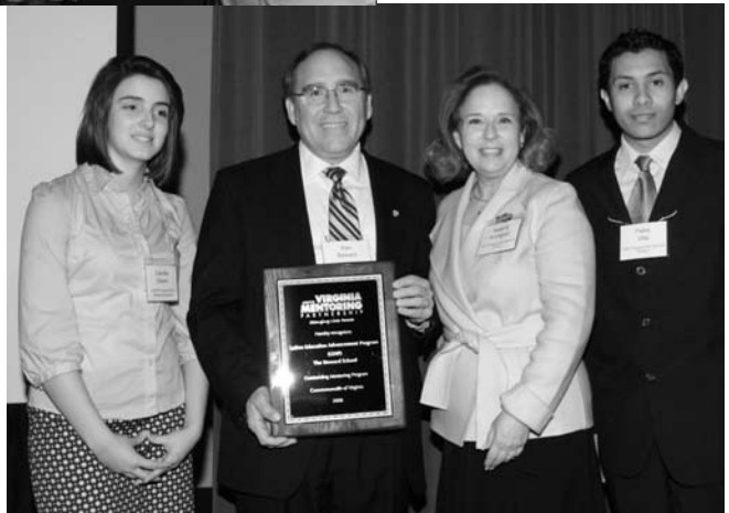
The Steward School's Latino Education & Advancement Program (LEAP) received an Out- standing Mentoring Program award.