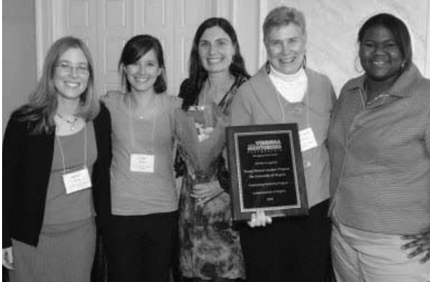
UVA's Young Women Leaders Program accepted an Outstanding Mentoring Program award.